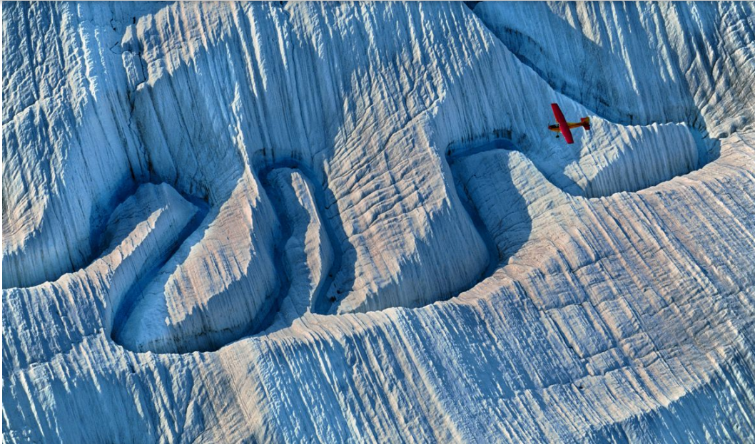
An aeroplane flies over a glacier in the Wrangell St Elias National Park in Alaska.