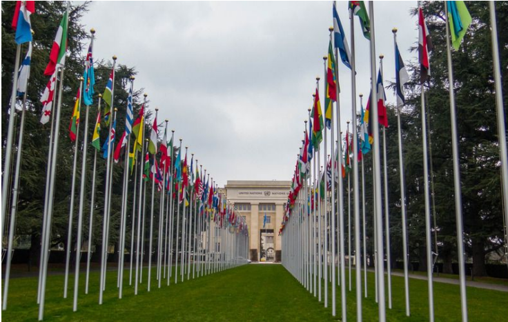
United Nations, Geneva