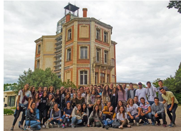
ELNA. Southern France